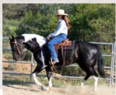
Signal Mount Equestrian, Inc.