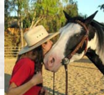
dba Great Horses of America